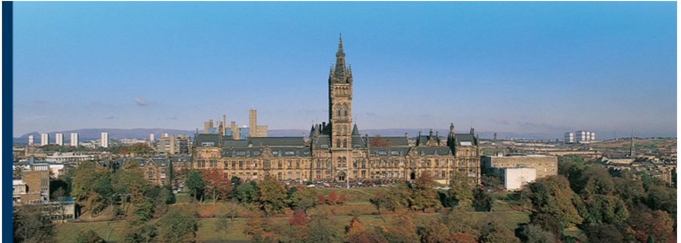
Glasgow University main building complex with the University Tower on Gilmorehill viewed from the south. The West Medical Building can be seen slightly below to the left.